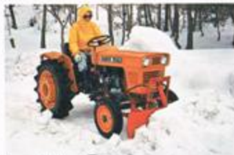
Front end blade