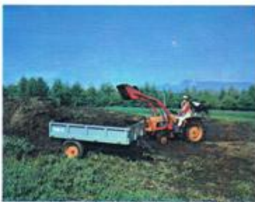
Loader (front end mount type)