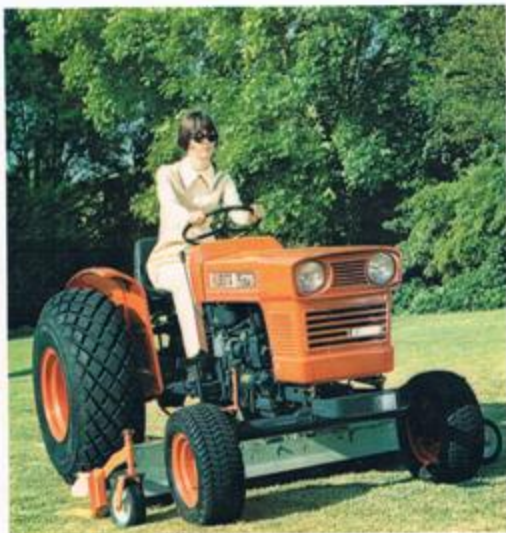
Rotary cutter (mid-mount type)

Accommodates a full line of implements for mowing, cultivating, tilling, snow throwing, hauling and loading, etc.