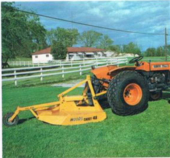
Rotary cutter (rear-mount type)